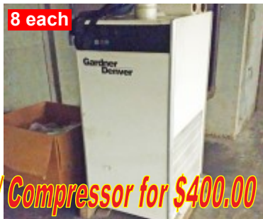
Air Dryer for Compressors Several to Choose From $295.00 each