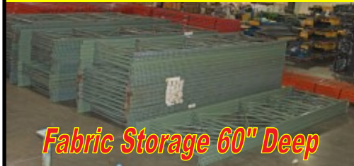
Fabric Storage 60" Deep