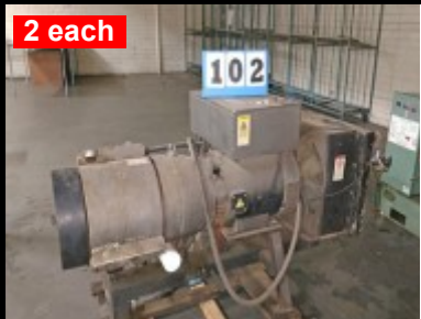
CompAir Kellogg 20HP Hydrovain Air Compressor Model 88PU, 460/230v $1,850.00 each