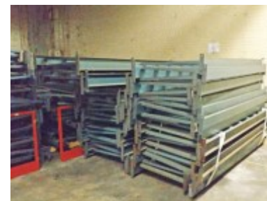
Bolt Together Warehouse Racking Uprights... 10' to 13' Tall x 42" Deep... 95+/-... $40.00 ea Shelving... 10' Long x 42" Deep... 230+/-... $20.00 ea Buy All... $7,425.00