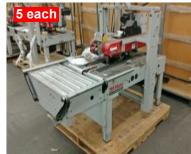
3M Random Case Sealer Several Available, 110 volt $1,495.00