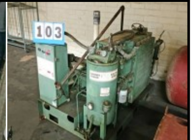
Gardner Denver 40HP Screw Air Compressor Model DE0HA, 460/230v $2,995.00