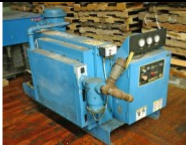
Quincy 40HP Screw Air Compressor, 460/230v Model 0SB40ANA22M $2,500.00