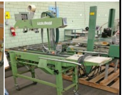
Little David Case Sealer Semi Automatic, Model LD4C $995.00