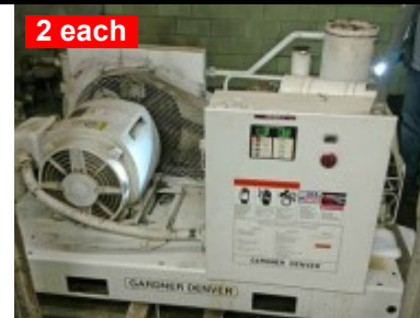
Gardner Denver 50HP Air Compressor, 460/230v Model EDE99K $4,500.00